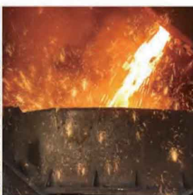
Metallurgy & Mining